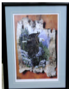
Regal Impressions II –Paul Livingston – 25”w x 34”h

Interested in some art work and supporting a charity at the same time? These prints are available for sale and come framed and ready to hang on your wall!