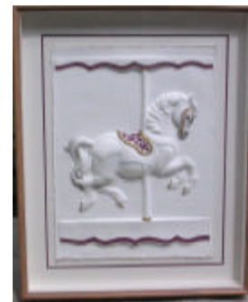
Carousel –Virginianne – 27”w x 33-1/2 h

To order, simply contact the STAS office and we will be happy to assist you in purchasing a picture. These beautifully mounted and framed prints are available at the amazing price of $250.00 each. All proceeds from the sale of these prints goes to Support & Trustee Advisory Services.