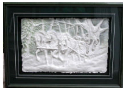
Sleighride – Joyce Betts - 34”w x 25”h