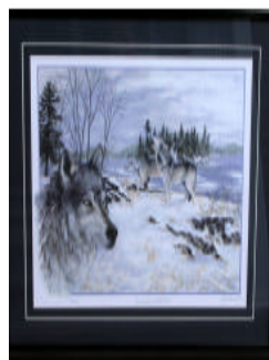
Voices from the North Shore –Paul Livingston – 32”w x 26-1/2”h