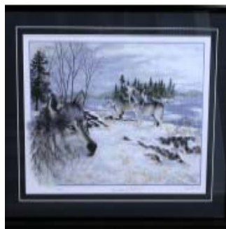
Voices from the North Shore –Paul Livingston – 32”w x 26-1/2”h