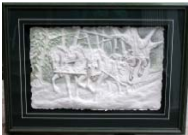
Sleighride – Joyce Betts - 34”w x 25”

Art work for sale~~~~STAS fundraiser~~~~Art work for sale~~~~