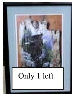
Regal Impressions II –Paul Livingston – 25”w x 34”h