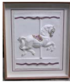
Carousel- Virginianne - 27”w x 33-1/2”h