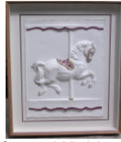
Carousel - Virginianne - 27" w x 33-1/2" h