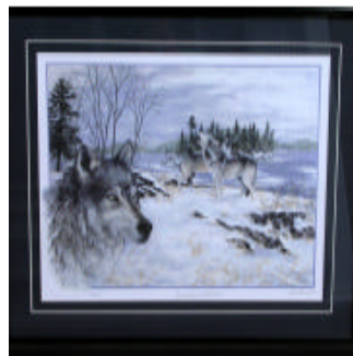
Voices from the North Shore –Paul Livingston – 32" w x 26-1/2" h