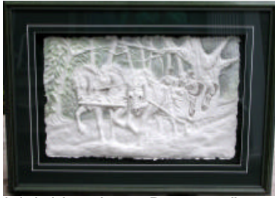
Sleighride – Joyce Betts - 34" w x 25"

Art work for sale~~~~STAS fundraiser~~~~Art work for sale~~~~